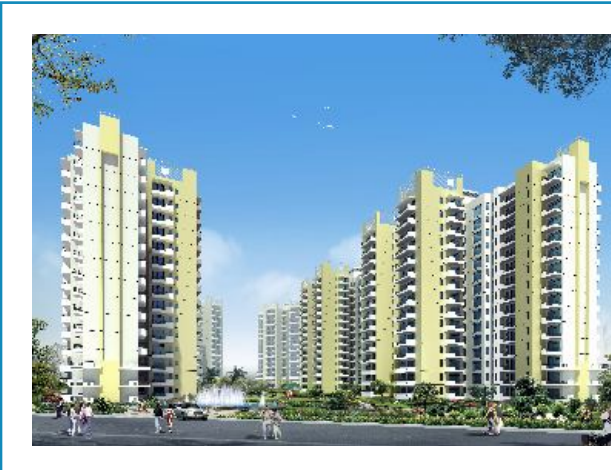
OPTUS CORONA, GURGAON