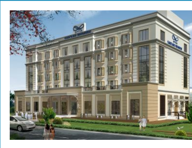
OPTUS SAROVAR PREMIERE, GURGAON