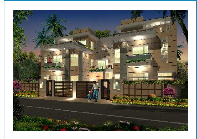
BOUTIQUE VILLAS, GURGAON