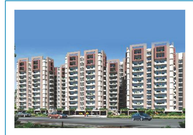
GOLDEN TULIPS, FARIDABAD